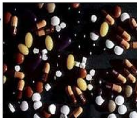
Taking antiretrovirals may stave off HIV infection

Sexual partners of patients with HIV should be routinely offered drugs which could prevent them becoming infected, say researchers.